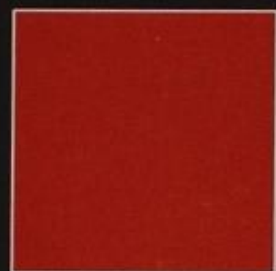
U851 Chili Red