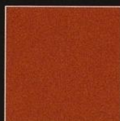
WB23 Spice Orange Metallic