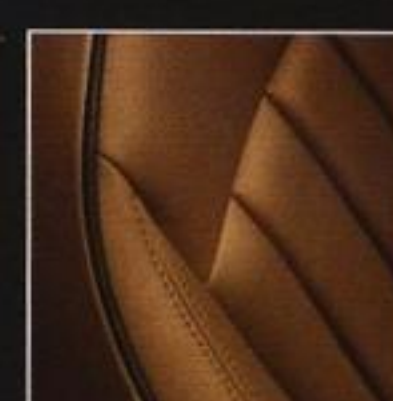
T9DT Lounge leather 1,2 Toffy