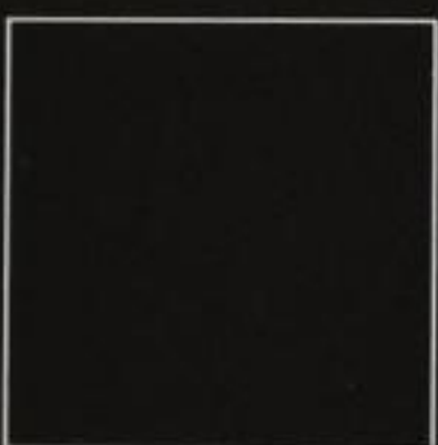
4BD Piano Black