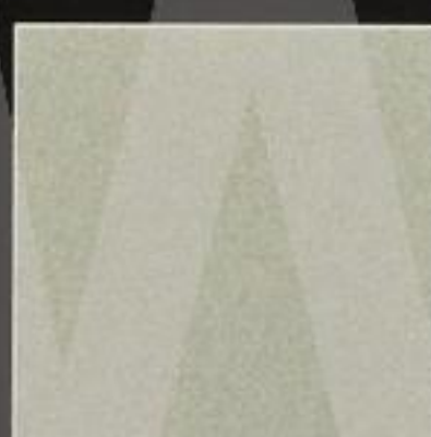
WA62 White Silver Metallic