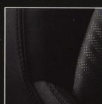
T8FP Punch leather 1,2 Carbon Black/Beige