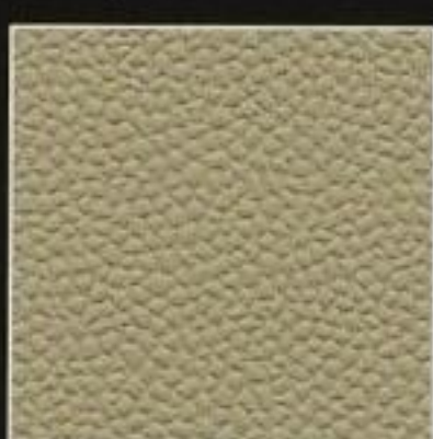
4C3 Satellite Grey