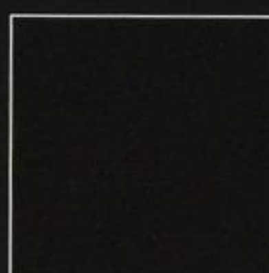
WA94 Midnight Black Metallic