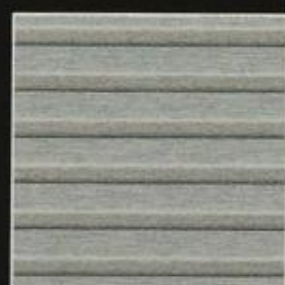
4DA Striped Alloy (genuine)