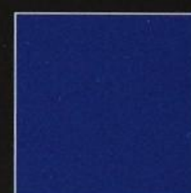
WA63 Lightning Blue Metallic