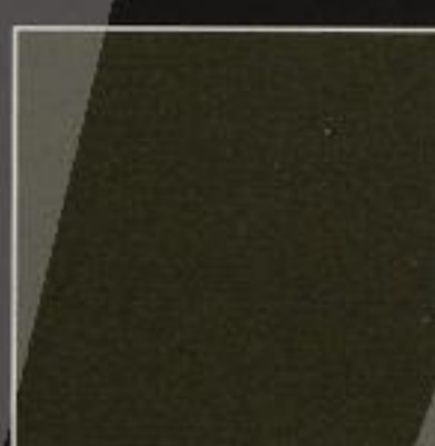
WB24 Eclipse Grey Metallic