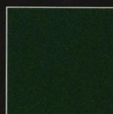
WB22 British Racing Green II Metallic